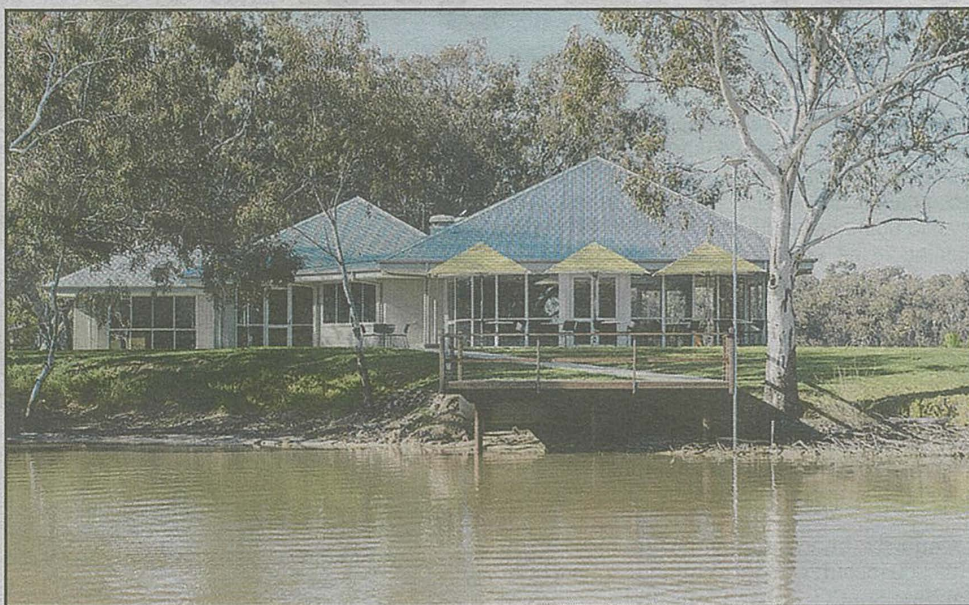
The award-winning Urana Aquatic Leisure Centre by Regional Design Service.

The Jury said of the project: "The Urana Aquatic Leisure Centre showcases and achieves the unwavering spirit of local com-